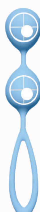
DIARIES OF GEISHA