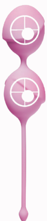
ONE THOUSAND AND ONE NIGHTS